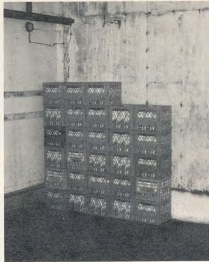
This was all the product left at Prince Rupert before the barges arrived Nov. 7.

Ingles spent some anxious moments trying to balance the product between