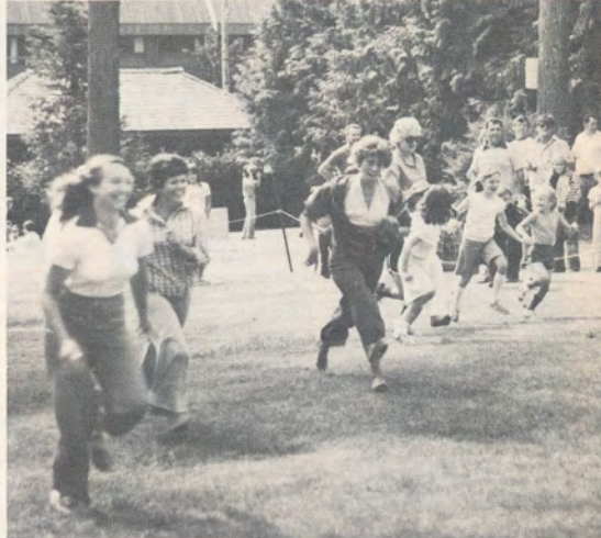
Open race for anyone under 30.