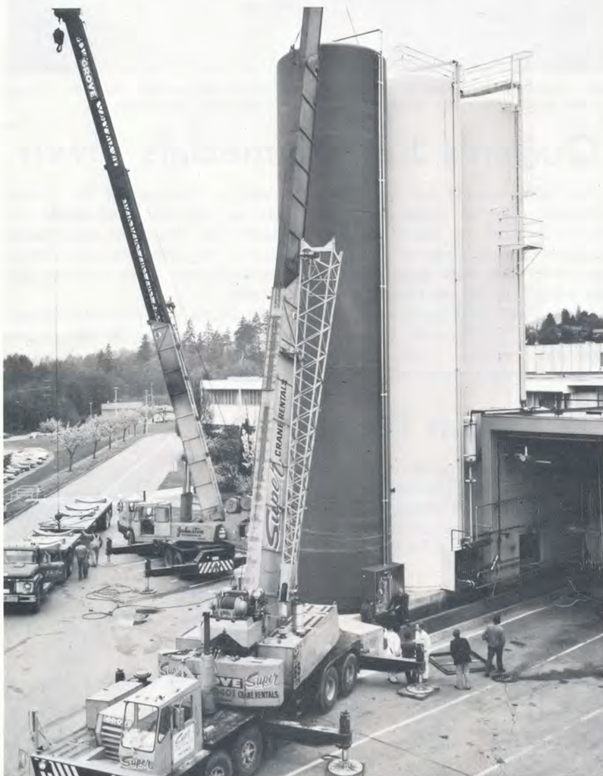
A third refrigerated silo tank has been installed on a preconstructed foundation at the Burnaby Plant. This completes facilities which were planned several years ago to allow more raw milk to be stored over a shorter work week and holiday weekends. This 428,000 capacity silo came from Wisconsin by train and was unloaded at Lake City.

Communication between the boat driver and the skier is essential. There are two important verbal signals. "In Gear" tells the driver to put the motor in gear and slowly idle away from the skier until the line is taut. "Hit It" tells the driver to accelerate sufficiently to pull the skier out of the water or off the dock.