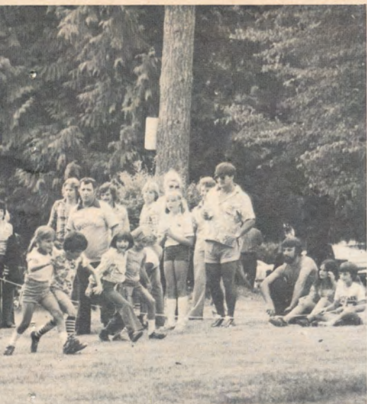
Three-legged race for the kids.