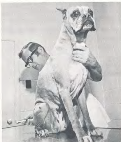
Annual vaccination is an important protection measure. Agri-foto

With control or eradication of rabies not yet within reach in Canada, the only defence is to guard against the disease—especially with annual vaccination and control of pets—and take swift action should it occur.